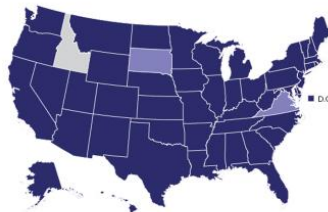
Where It's Legal To Breastfeed In Public

■ Moms can breastfeed wherever, whenever they want ■ Breastfeeding moms are exempt from public indecency or nudity laws □ No laws protect moms who breastfeed in public